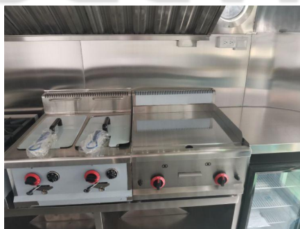
- Cooking Equipment -