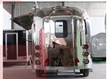
- Door -