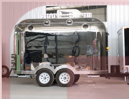
- Rear -