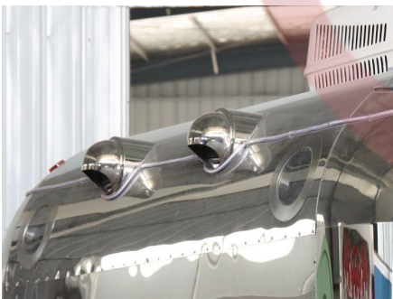
- Vents -