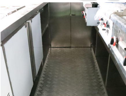
- Floor -