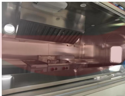
- Inside -