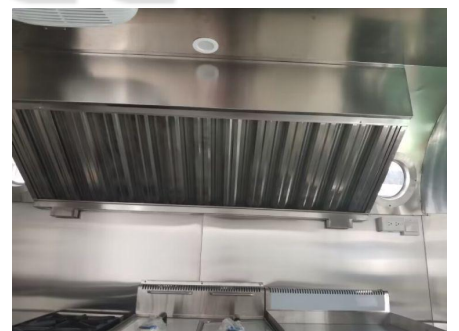
- Range Hood -